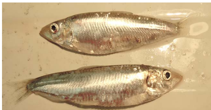
Figure 1. Common kilka ( Clupeonella cultiventris caspia )

is regarded as an excellent source of high quality protein, particularly the essential amino acids lysine and methionine (Sathivel and Bechtel 2006). Many protein-rich seafood byproducts have a range of dynamic properties (Phillips et al. 1994) and can potentially be used in foods as binders, emulsifiers, and gelling agents (Sathivel et al. 2004). The FPP, kept above 0°C has many advantages in food trade such as ease of handling, low distribution costs, convenient storage and ease in mixing with other ingredients (Shaviklo