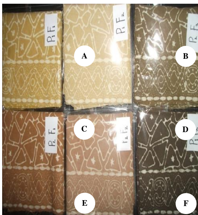
Figure 2. Batik cloth resulted from fixation. Note: A. P 1 F 1 : field location, alum fixator B. P 1 F 2 : field location, calcium oxide fixator, C. P 1 F 3 : field location, ferrous sulfate fixator D. P 2 F 1 : rice field location, alum fixator, E. P 2 F 2 : rice field location, calcium oxide fixator, F. P 2 F 3 : rice field location, ferrous sulfate fixator.